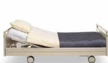
BED W81" x D38" X H20"