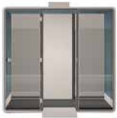
POD W95" x D61" X H91"