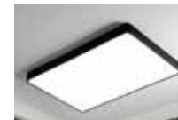
LAMP W16" x D16" X H2"