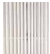
CURTAIN W95" x D2" X H91"